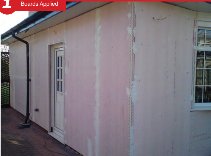
1 Boards Applied